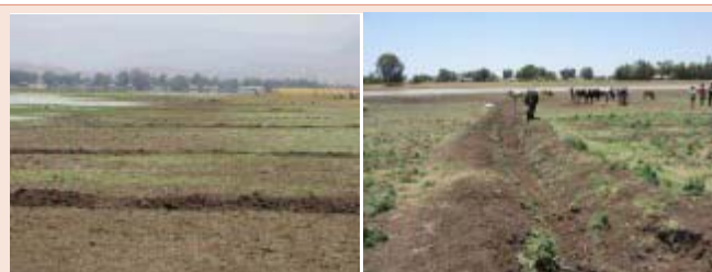
Figure 8: Furrows of Welala reservoir with 50 m intervals at both sides of farm lands to irrigate their crops.