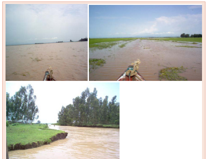
Figure 2: Shesher reservoir during rainy season, and joining Lake Tana from left to right.

During pick dry season of March, 2012 the survey showed unexpected, amazing and sudden death of a home for many biodiversity and life full of Shesher natural resource dried up totally and birds fetch their food from remnants small shrieked wet mud spot (Figure 3). This happened due to several and unlimited human encroachments for different activities mainly for crop cultivation, with out any rules and regulations. Major crops cultivated by drained Sheshers water using gravitational force were Eragrostis teff , Cheak pea, Lentils and Safflower (Figure 4). It seems the community lacks knowledge and awareness about Shesher reservoir wetland of sustainable use other than exploiting beyond its maximum limit.