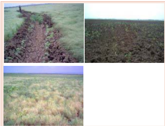
Figure 4: Major crops cultivated by draining water through furrow irrigation system from Shesher reservoir of Lake Tana wetland.

Livestock production system in Welala wetland became totally dependent on leftovers and residues of crop production because during the rainy season cattle left the area due to high volume of flooding problem and during the dry seasons the area was shifted to crop cultivated land. The only area considered for communal grazing land by the community was the open water of Welala during its drainage period assuming the area becomes devoid of water. But there has not been observed any foraging types, it was free from vegetation cover and livestock of the surrounding waiting for watering systems