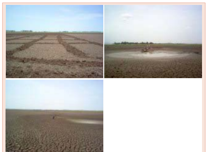
Figure 3: Total dried up of Shesher reservoir with shrieked mud aggregated by birds at the center.