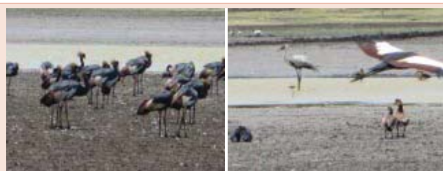
Figure 10: Ecotourism and fisheries are assumed to be an appropriate intervention in Welala wetlands of lake Tana.