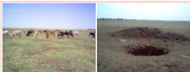
Figure 7: Digging ground water (Well) at the center of Shesher reservoir for their animals after complete dried up of the reservoir.

According to the 100 interviewed respondents from Shesher and Welala surrounding villages, replied that 100 % of them were engaged in fishing especially during pick and post rainy seasons of a year. About 95% from Shesher and 75% from Welala responded that they were using the wetlands for cattle grazing through out the year in the previous years. According to the Intergovernmental Panel on Climate Change (IPCC).The new knowledge enables IPCC to improve their