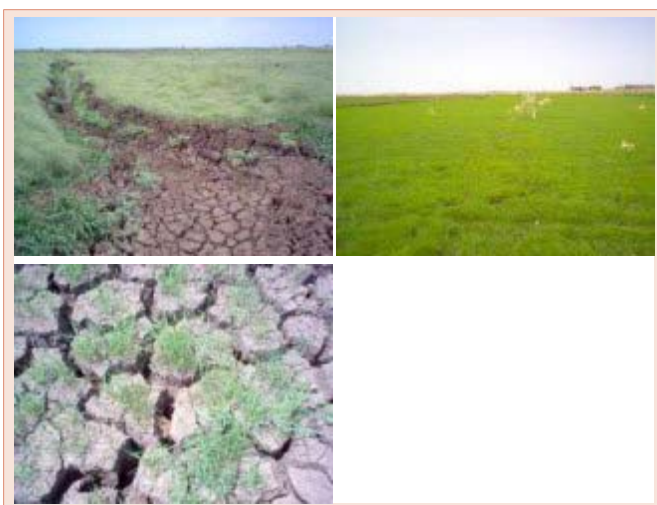
Figure 5: Lack of irrigable water that shows cracked soil and poor plant color of Eragrostis teff that might lead to wilt and death of a plant prior to ripe.