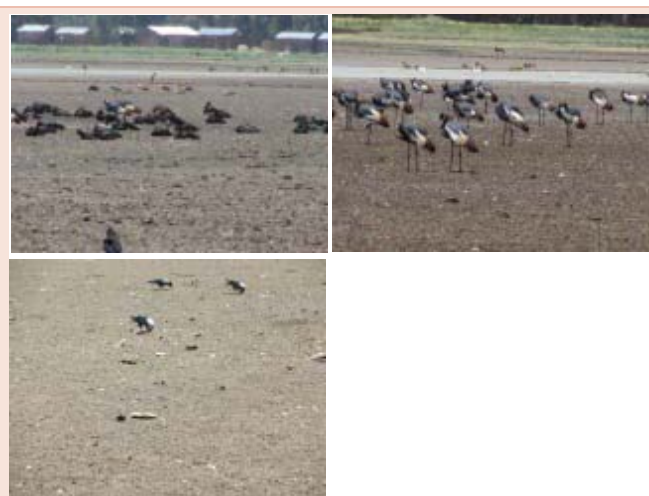
Figure 9: Highly populated birds and remnant dead fishes eaten by birds in the highly shrunk and almost dried Welala wetlands.